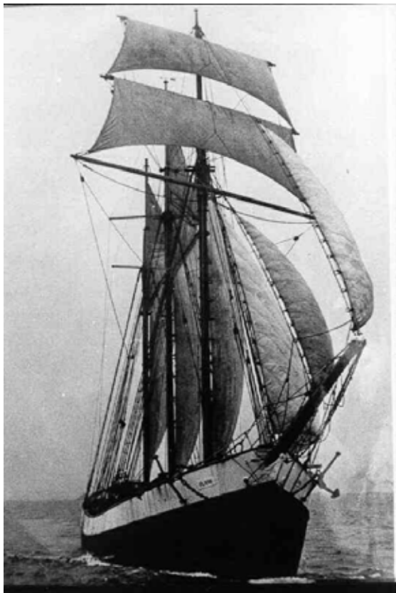
The Result (pictured left, in the 1950s)

The Result had been built in 1893 in Carrickfergus in N. Ireland. Her frames and plates were of steel and she measured 122 gross tons. At her launch she was described as the finest small sailing vessel ever built in Britain.