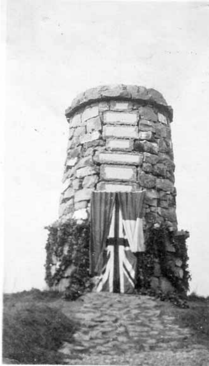
The 9 th (Scottish) memorial, 9 th April 1922