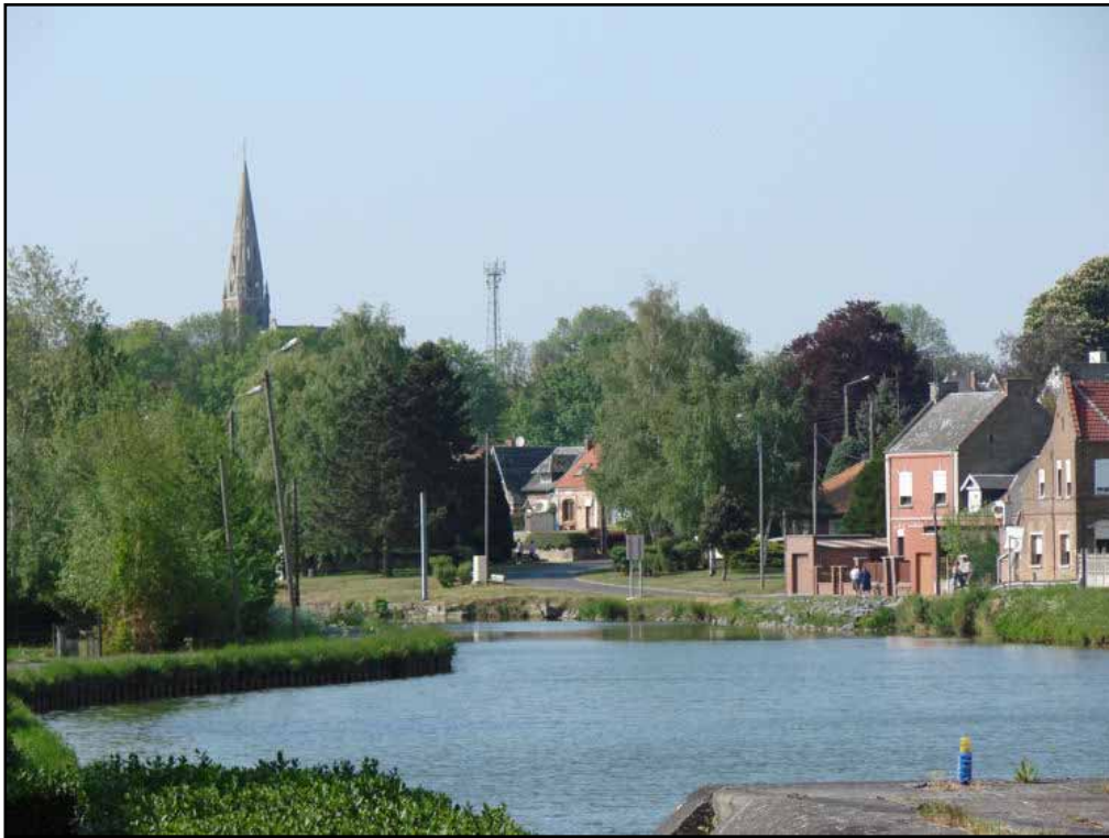
The view from the lock on the St Quentin canal looking towards Masnières

The new Thiepval Visitor's Centre was most impressive, and time was also found to visit the Arras Memorial and the tank memorial at Pozières, with its wonderful scale models. However the highlight for me was seeing the newly refurbished Canadian memorial at Vimy. The sheer scale of it, along with its elegant design and its placement in an area still pock marked by shell holes and trenches makes it a moving experience. Incidentally it is the only memorial where names are listed alphabetically running over from one block to the next, with no listing of rank or regiment (or so I was told by a kilted Scots guide). The view from the memorial over the Douai plain is also impressive.