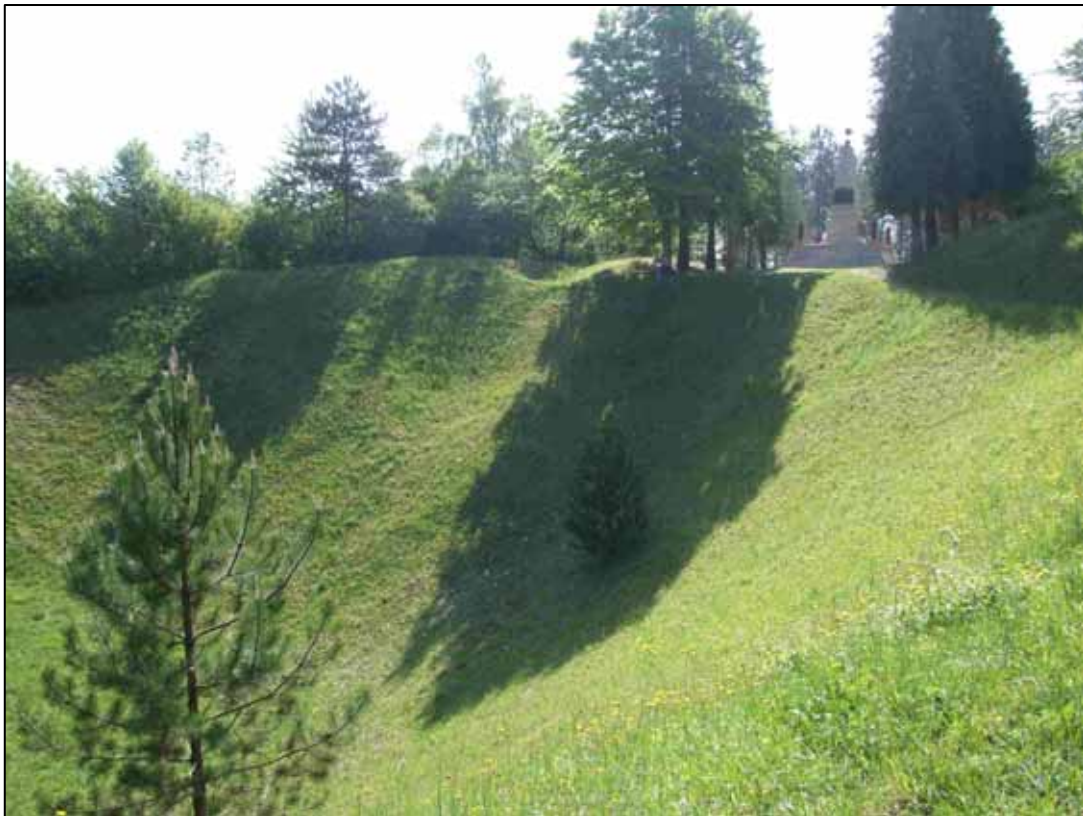
One of the massive craters on the crest of Les Esparges today

The day ended with a short stop in the woods above Apremont on the road to St Mihiel. There were a number of French monuments to commemorate the fighting here in 1915 when attempts had been made to reduce the Salient. There were also miles of former French and German trenches under the cover of the trees,