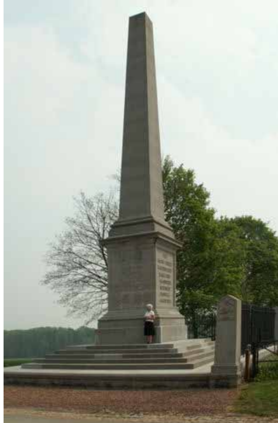
The Havrincourt memorial 85 years on.

The 9 th (Scottish) Division Memorial on the road out of Arras (see next page) was another place visited and photographed by Ada. Last time we were there it was impossible to get close to it as it was on a fenced off raised section between the carriageways of a busy main road. It has now been moved to an area of land next to Point-du-Jour Military Cemetery. Access is now the same as for the cemetery i.e. down a very long track from the small village of Athies-les-Arras. It is still next to the same very busy road but you don't have to cross it, and there is car parking for both the cemetery and the memorial.