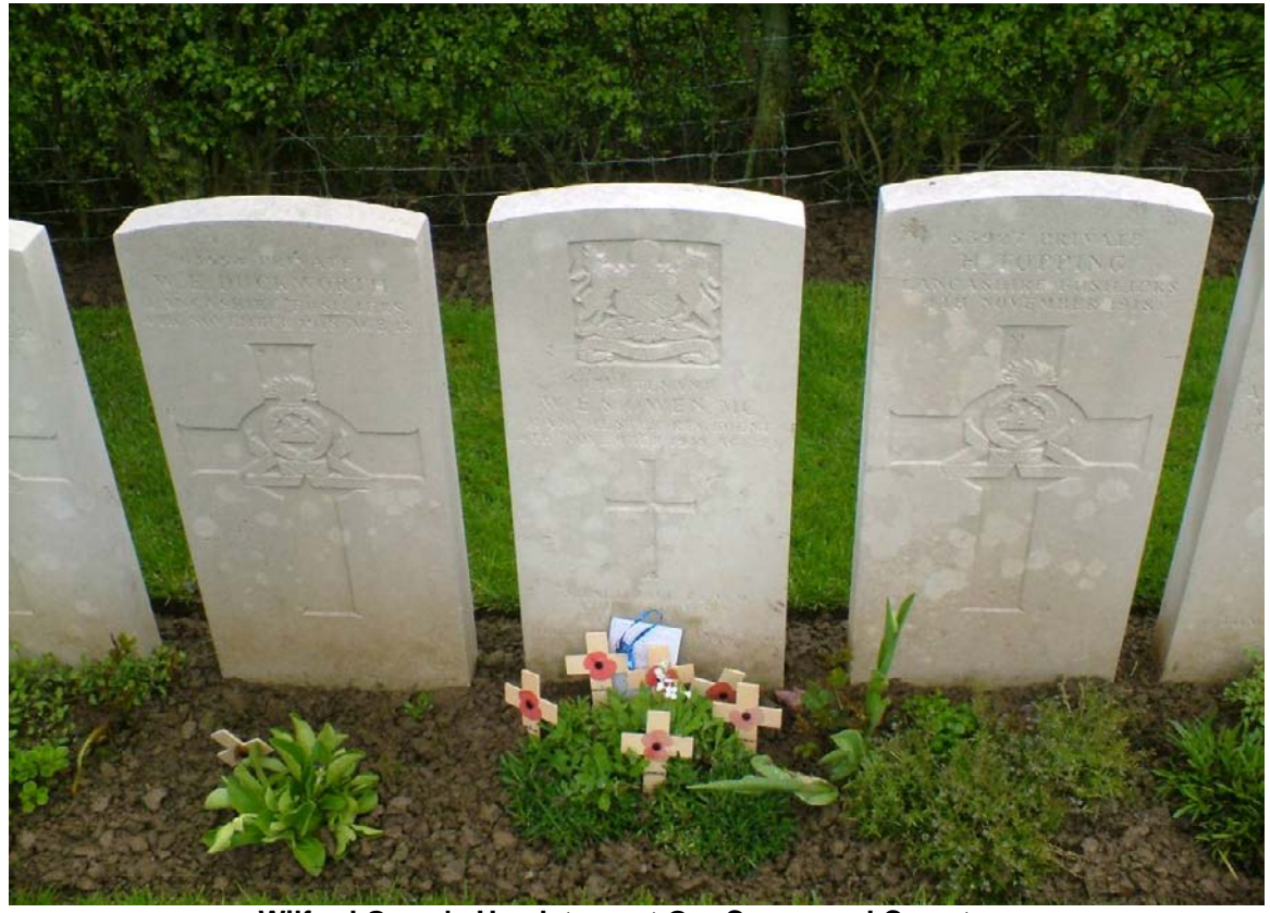
Wilfred Owen's Headstone at Ors Communal Cemetery

Any future accounts of your visits will be most welcome for inclusion.