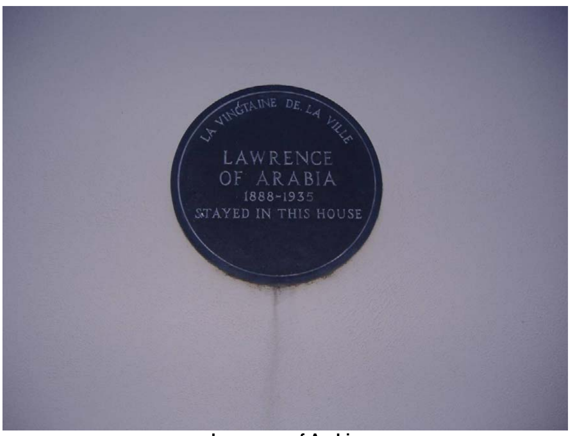
Lawrence of Arabia The Bramerton House plaque