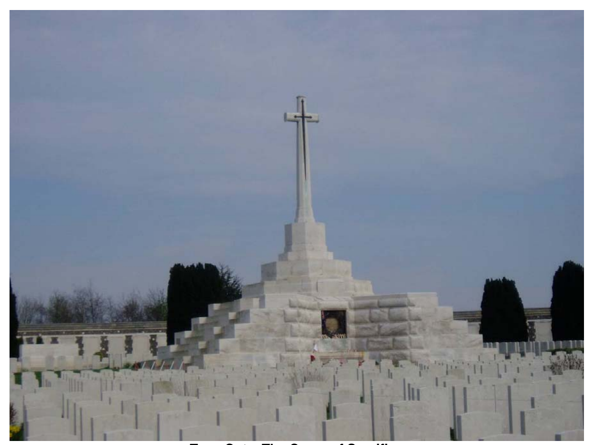
Tyne Cot – The Cross of Sacrifice

"Last week I went to the Flanders Field Museum at Ypres (where a RGLI badge is part of one of the displays, incidentally), attended the Menin Gate Last Post ceremony, and had a relatively unsuccessful visit to the town and departmental archives in Arras. One was closed because heavy rain the day before had caused flooding, the other closed early without prior notice because of a staff retirement. Anyway, I took some good shots at Tyne Cot, the Arras town memorial, Fauboug d'Amiens cemetery in Arras, Ploegsteert Wood and the Ploegsteert Memorial. The planting at the cemeteries is lovely - different in different settings and seasonal -completely different from when I visited last summer. It's amazing how peaceful they always are, even when they are near busy roads or in towns. I'm in Jersey from 15<sup>th</sup> to 17<sup>th</sup> April - OU day-school on the Saturday - might even catch up with some of you from "the other isle". I've attached a photo from my trip - Tyne Cot where many Channel Islanders are commemorated. Incidentally they are not listed under RGLI or similar - they are under Channel Islands Militia. I couldn't find them at first because of this."