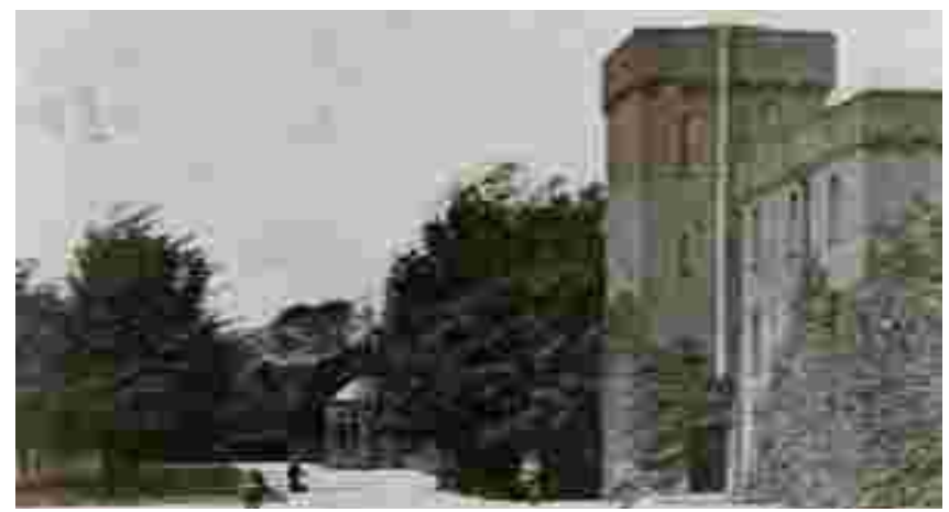
The Glen Parva Barracks opened in 1881