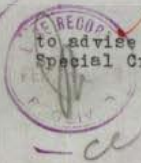
Major. C.O. Australian Graves Services.

Necessary action is being taken at this end to advise the next of kin of the erection of the Special Cross referred to.