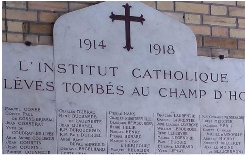
Remembered on the Memorial at L'Institut Catholique, Paris