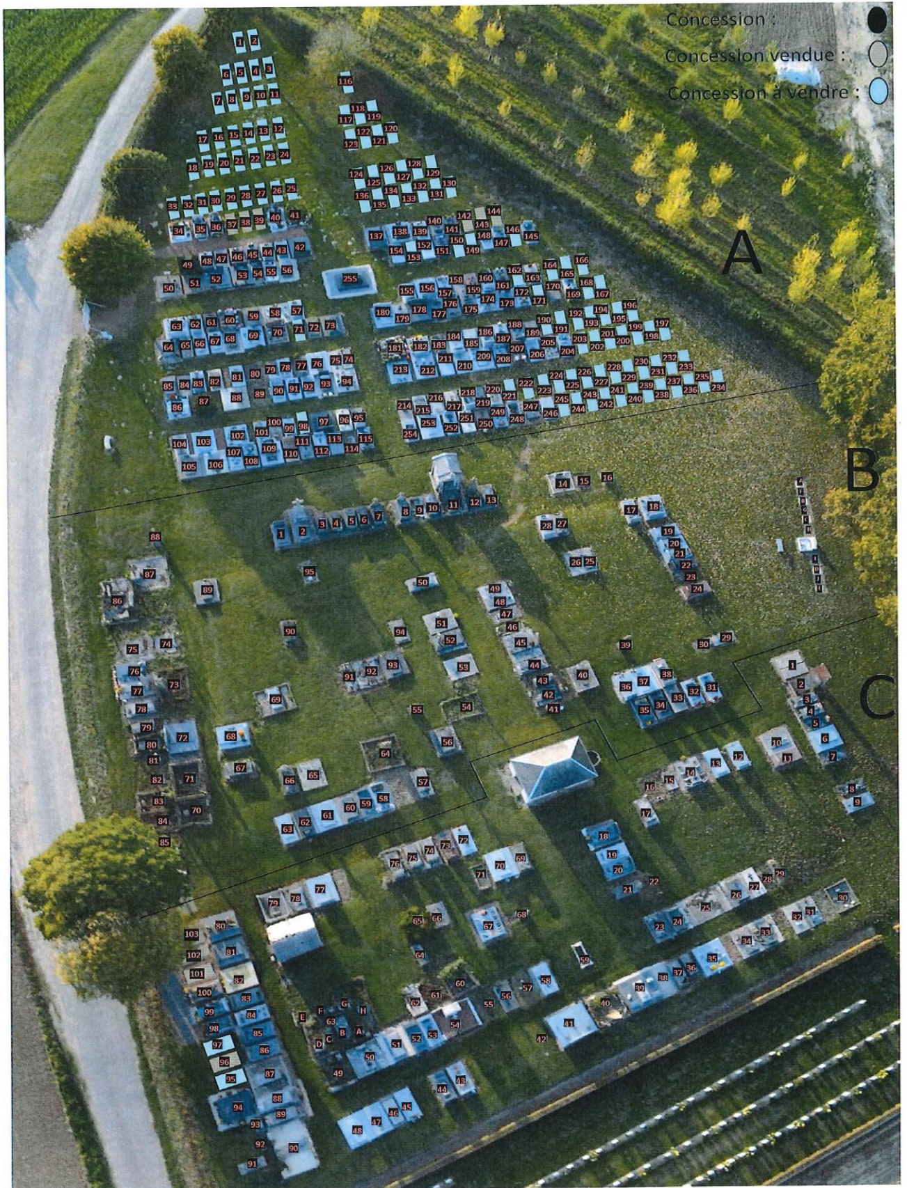
MAP OF CEMETERY COURTESY OF MAILLY MAILLET LOCAL AUTHORITY – THE GRAVE IS C75 (ZOOM IN)