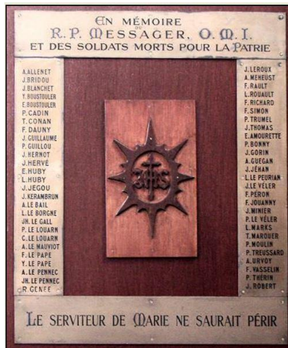
REMEMBERED ON THE WAR MEMORIAL AT ST POL DE LEON, FINISTERE (ABOVE) & ON THE WW1 MEMORIAL AT ST MATHEW'S CHURCH, ST PETER, JERSEY (BELOW)