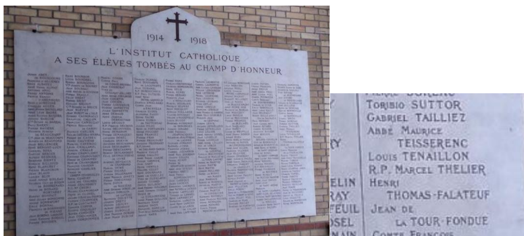
Remembered on the Commemorative Plaque at L'Institut Catholique Paris