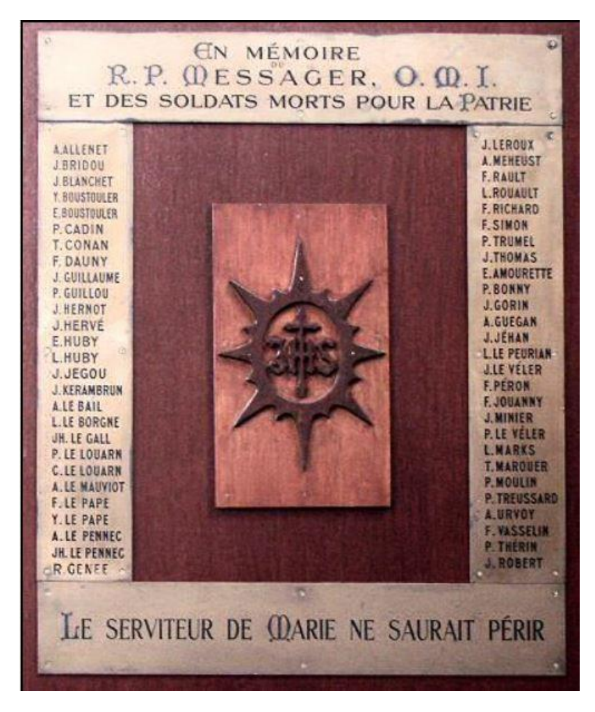
WW1 Memorial Board in Saint Matthews Catholic Church, St Peters, Jersey, Channel Islands.

Also commemorated on the Commonwealth War Graves Commission website, a number of virtual New Zealand websites, the Australian War Memorial website and the Channel Islands Great War Updated Roll of Honour for Jersey.