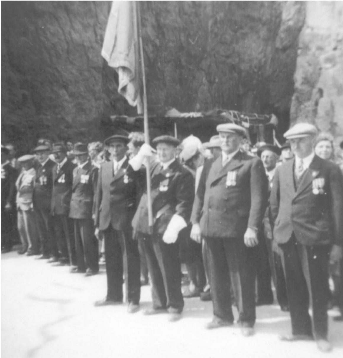
Maseline Quay 1949