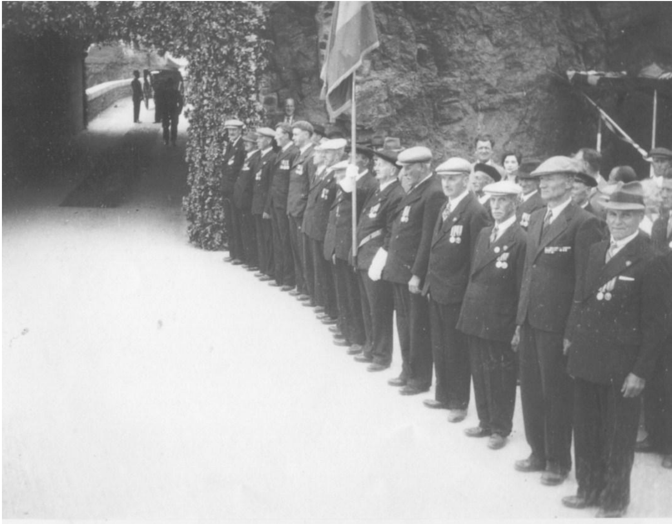
Maseline Quay 1949