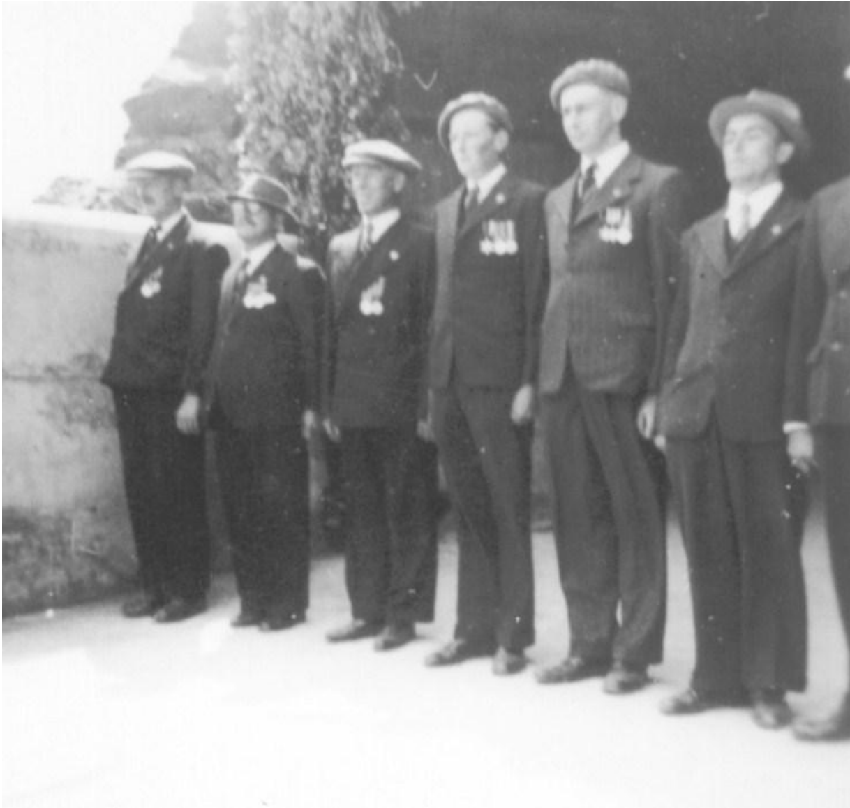
Maseline Quay 1949