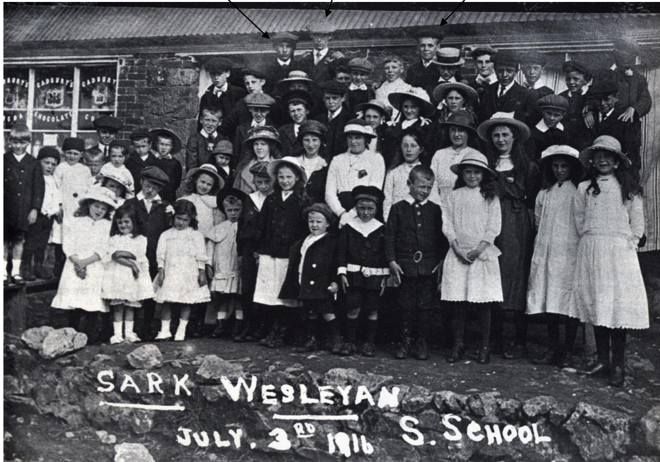
Methodist Chapel Sunday School, Clos á Jaon July 3 rd 1916