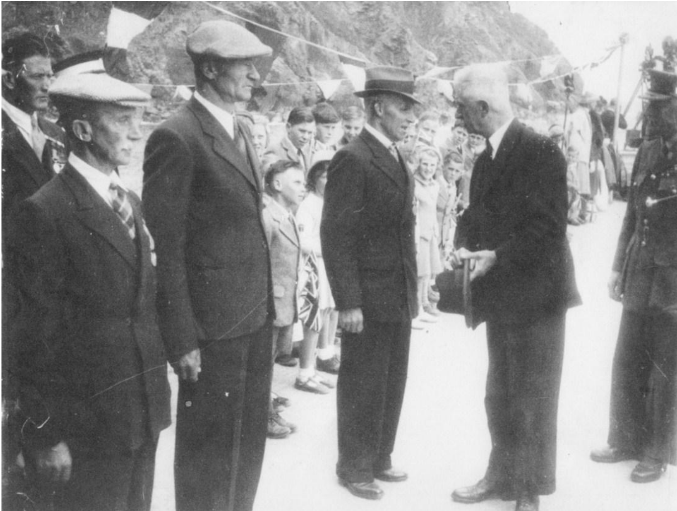
Maseline Quay 1949