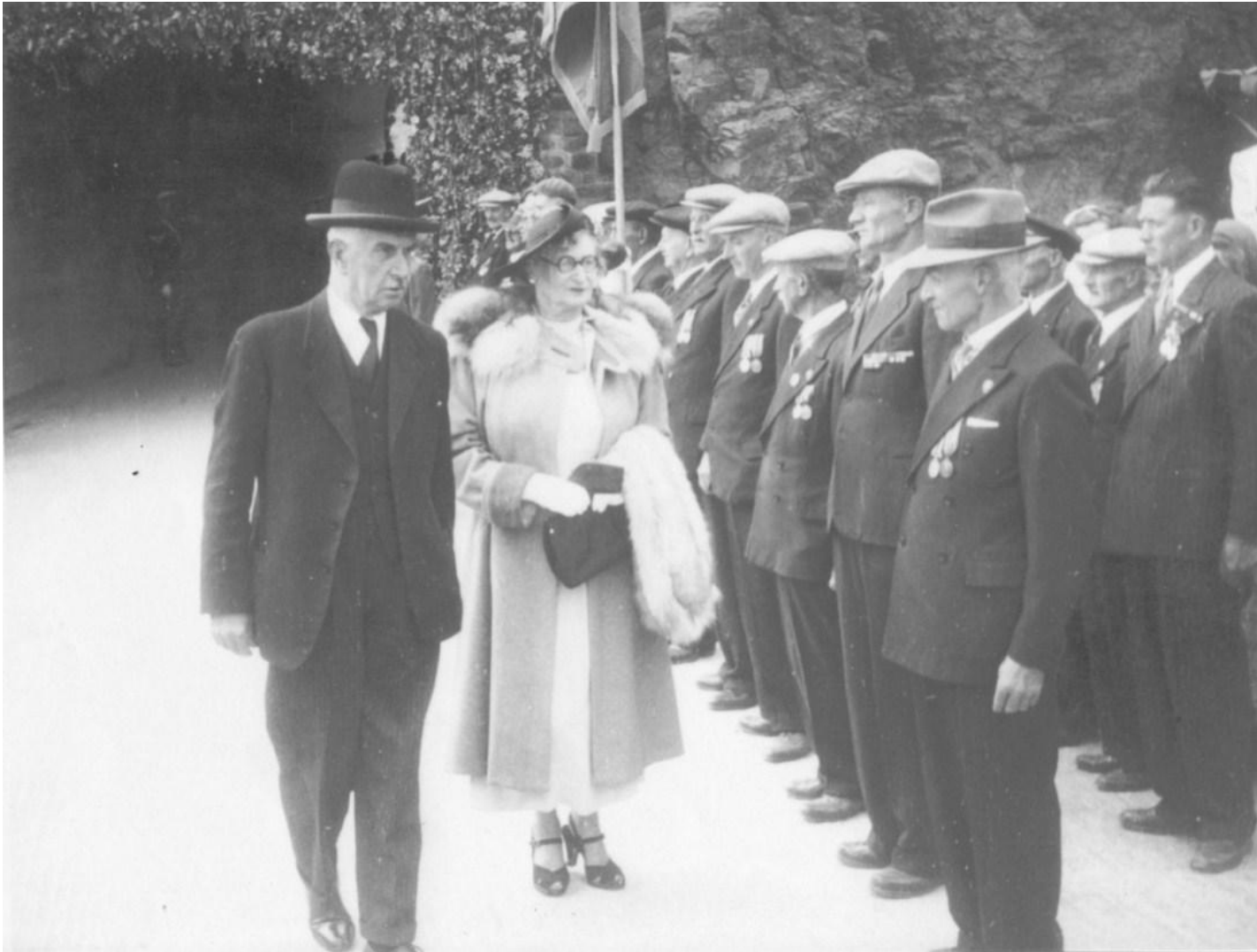
Maseline Quay 1949