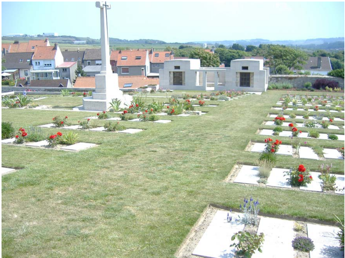
The CWGC Cemetery at Wimereux