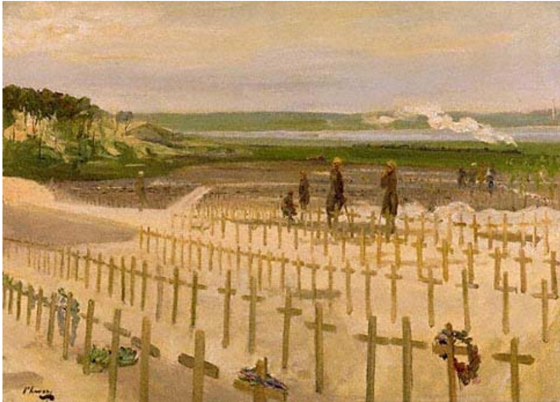
John Lavery, The Cemetery, Etaples , 1919