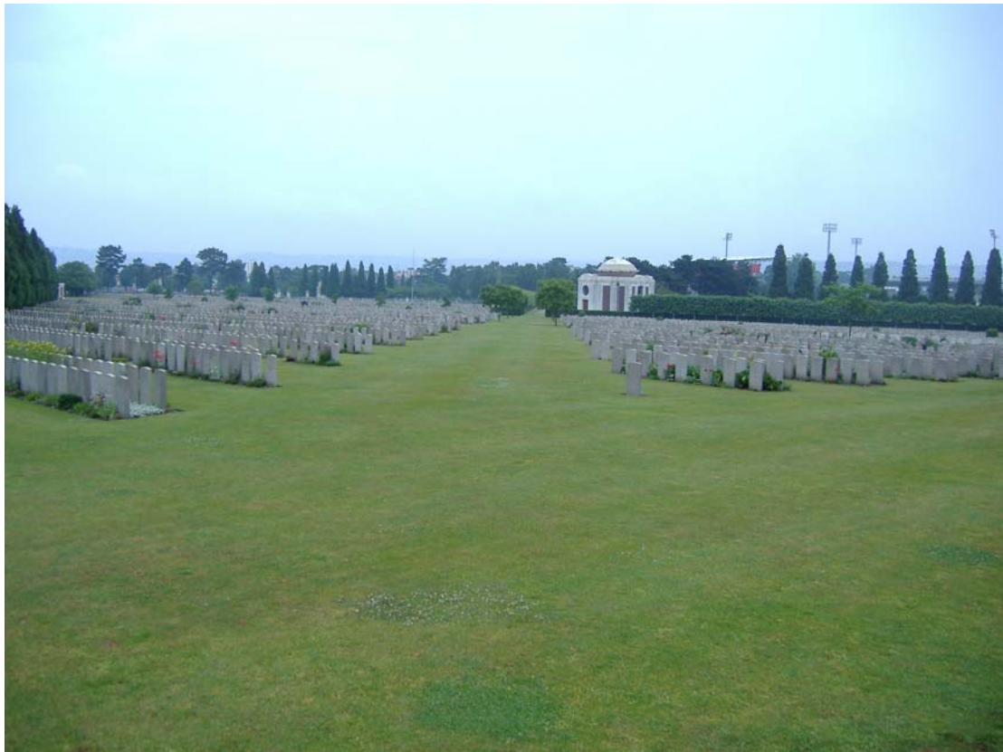
A view of St Sever from the Cross of Remembrance (Future visitors should note the stadium lights as a reference point!)