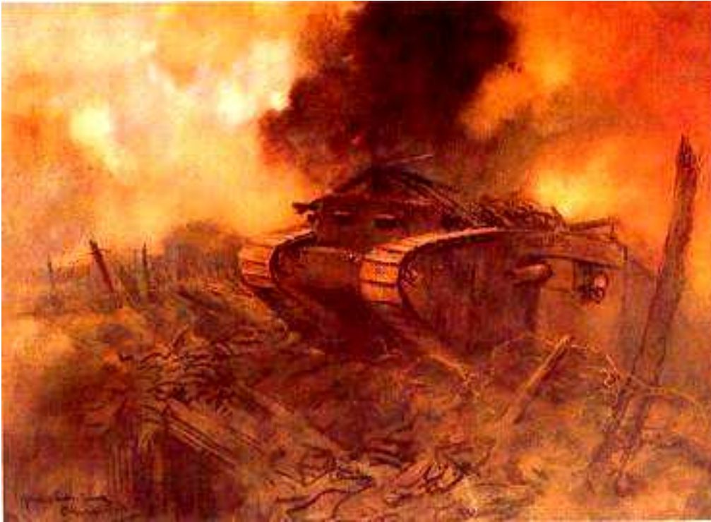
A 90 Year Old Debutant! (Artist Unknown)