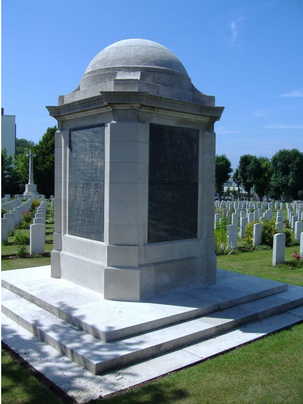
The Memorial to Salta, Galeka and Normandy at St Marie