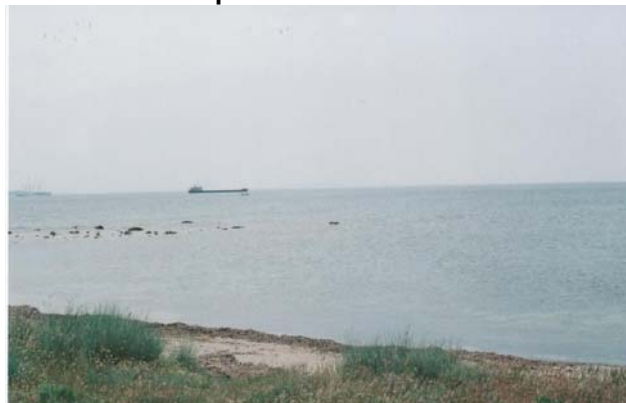
Y Beach – SS River Clyde Landing Beach

At Suvla Bay, the landing, which commenced on the night of 6 th August 1915, was intended to support a breakout from the Anzac sector, five miles to the south.