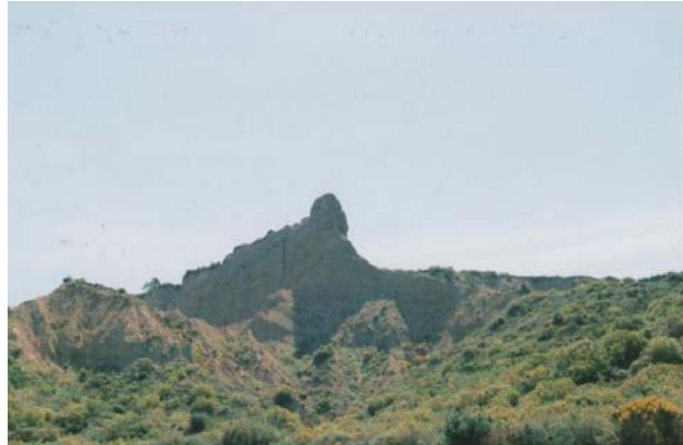
The Sphinx – Anzac Beach