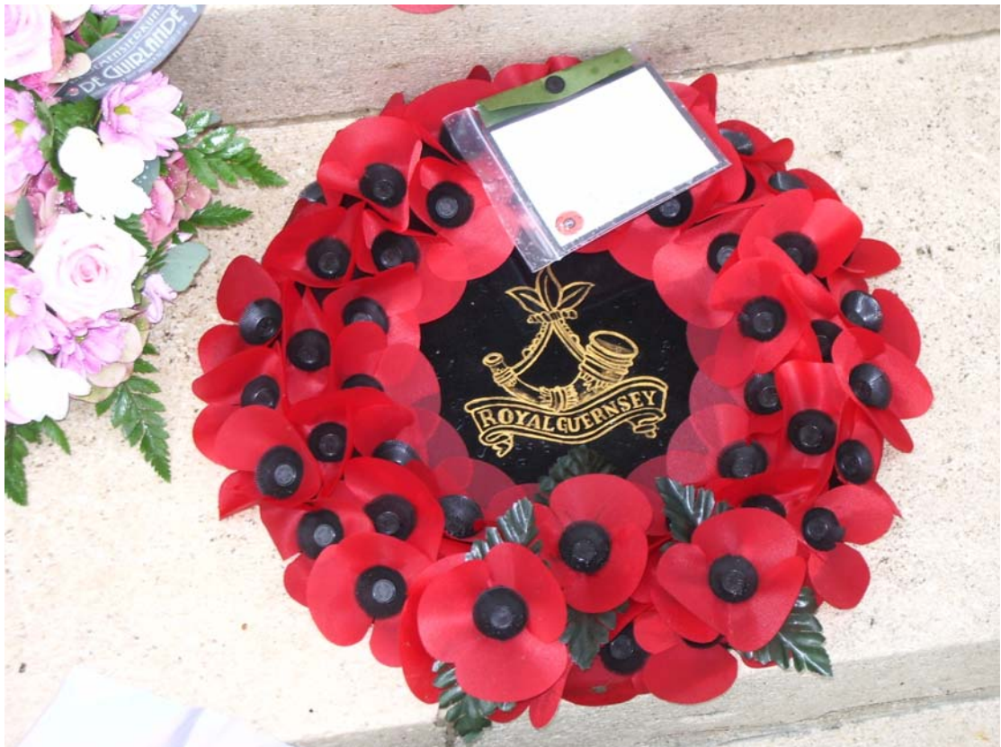
The RGLI Wreath