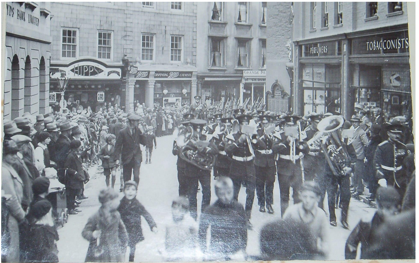
R.G.M. returning from Annual Training at Beaucamps. 1929. Passing up Smith St.