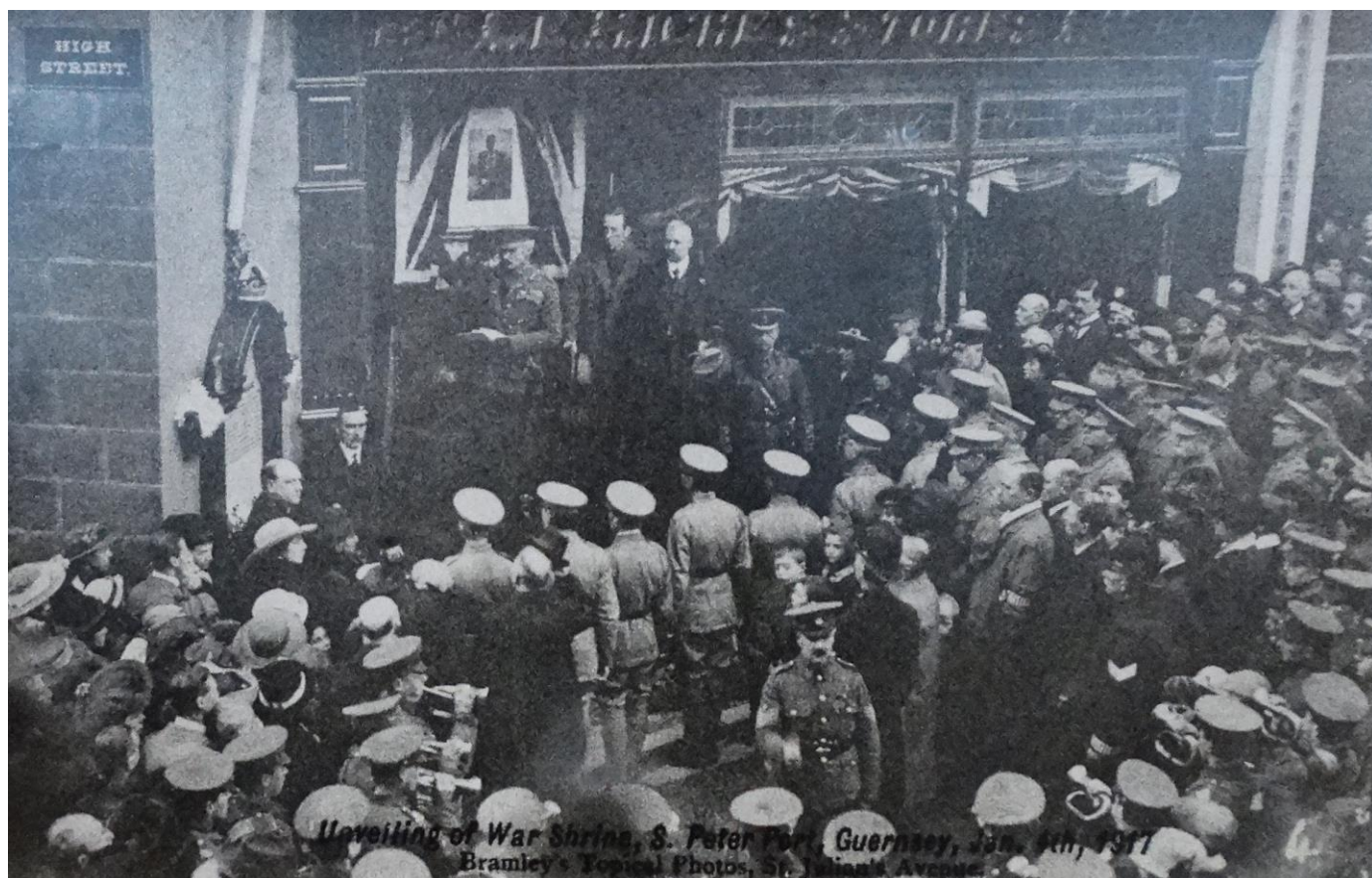
Unveiling of War Shrine, S. Peter Port, Guernsey, Jan. 6th, 1917