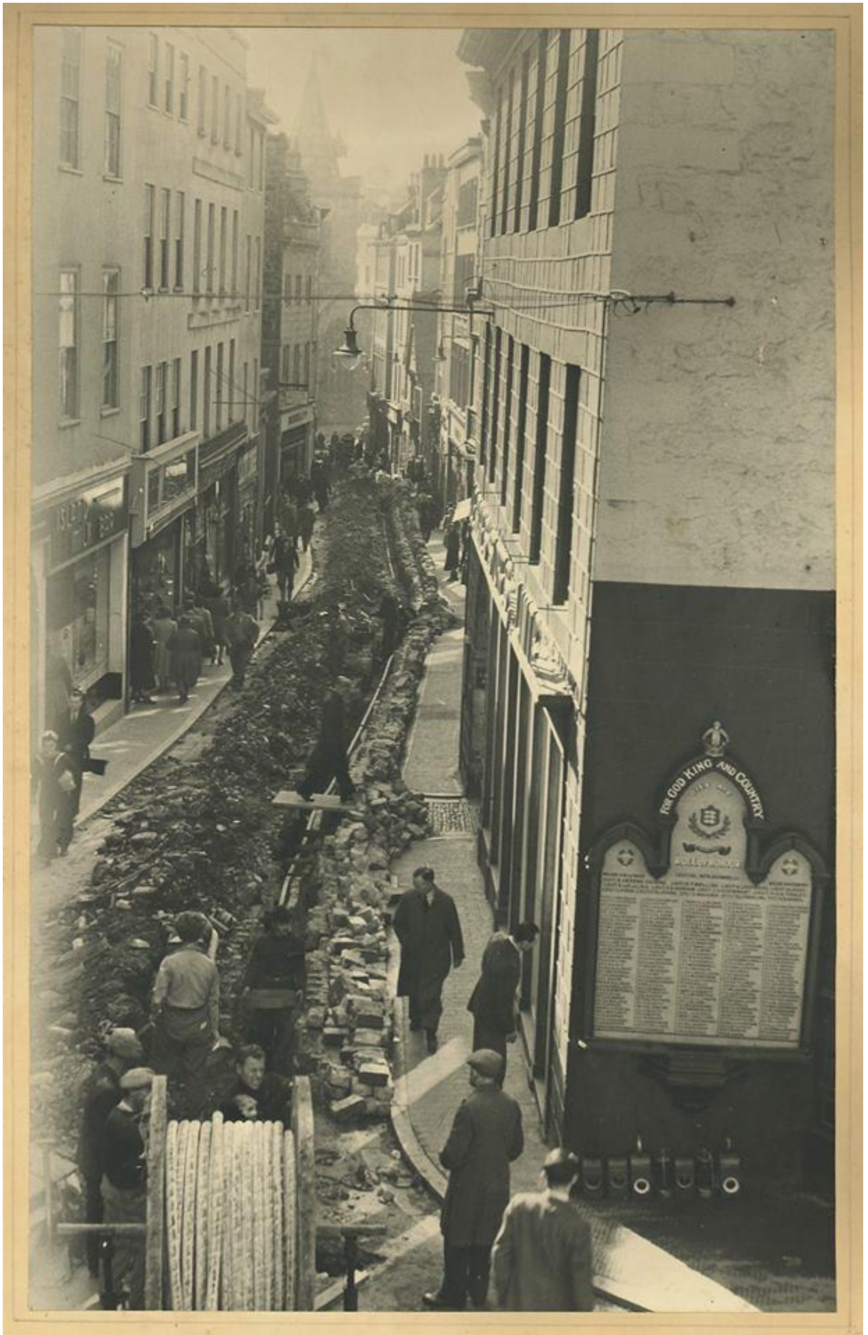
CABLE LAYING 1933.